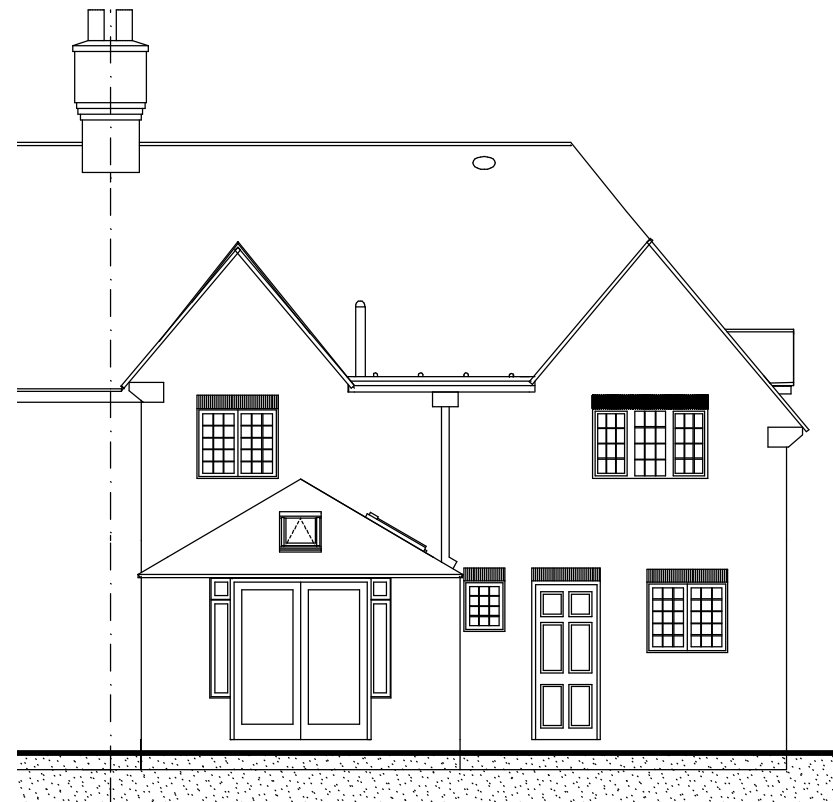
ELEVATION A-3 NORTH