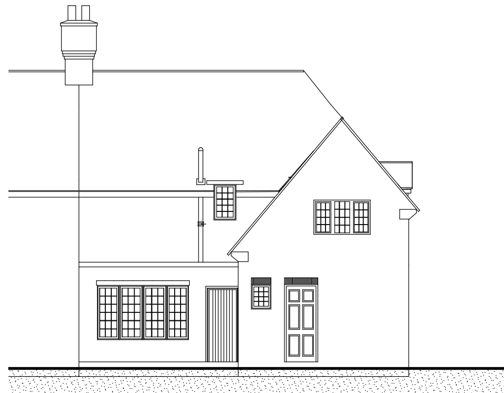
ELEVATION A-3 NORTH