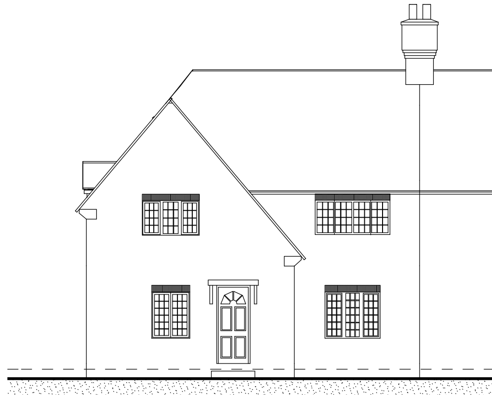
ELEVATION A-1 SOUTH